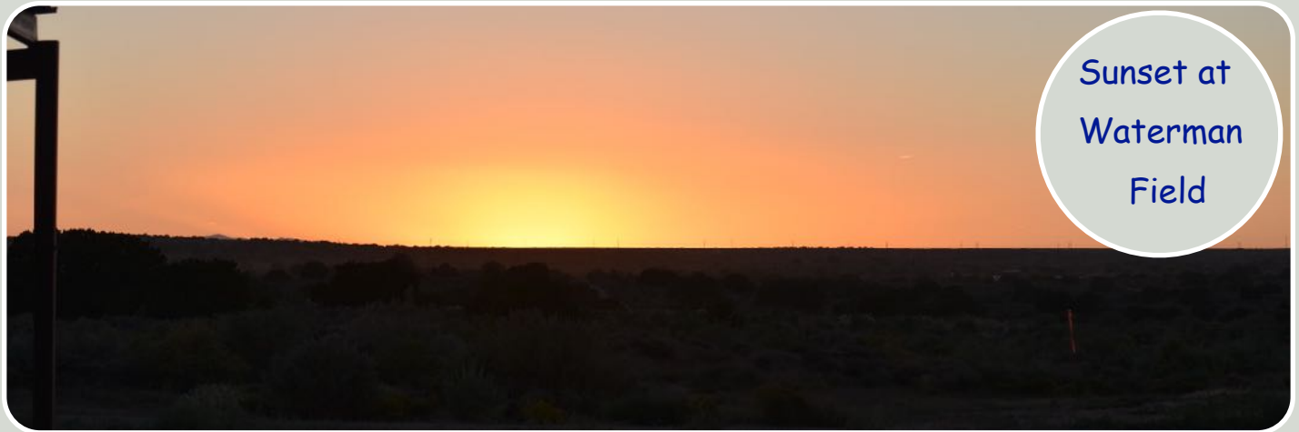
Sunset at Waterman Field