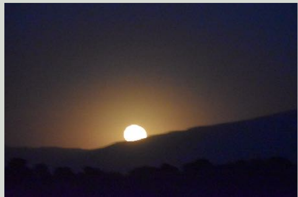
Moon rise over the mountains from the field