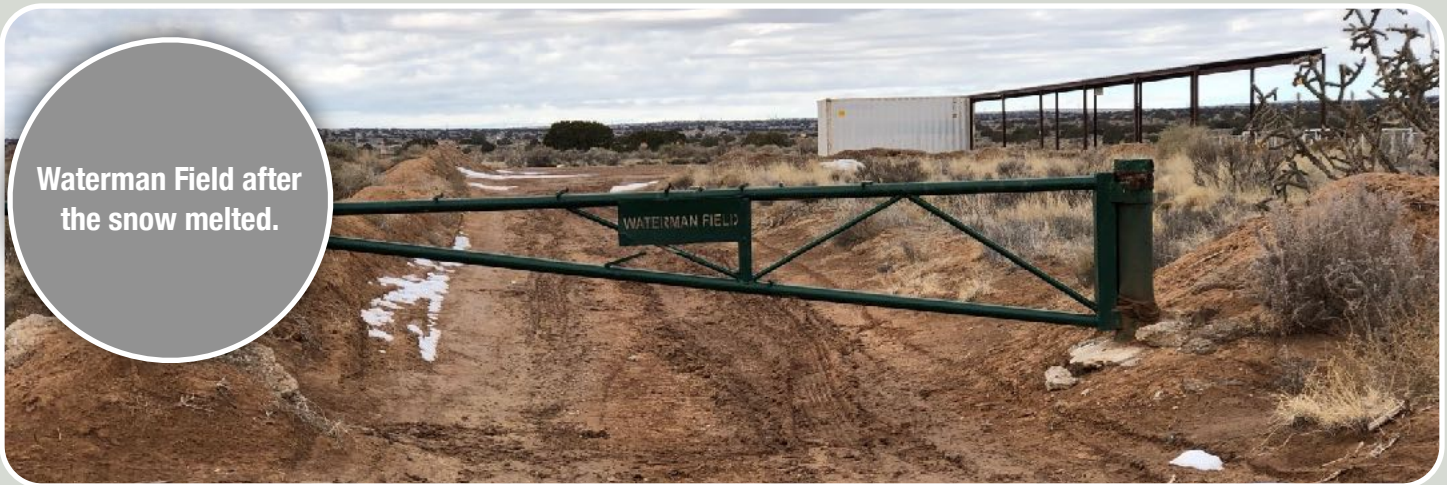
Waterman Field after the snow melted.