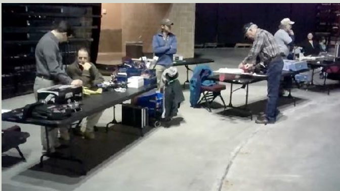
Table set-ups from the air