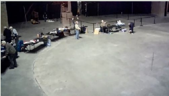
Table set-ups from the air