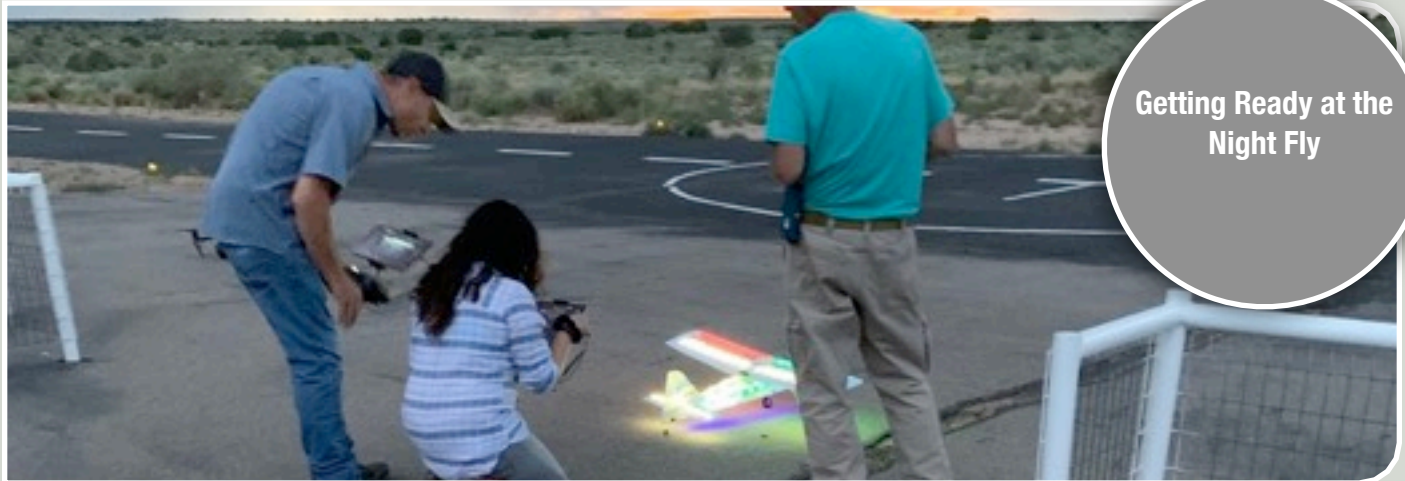
Getting Ready at the Night Fly