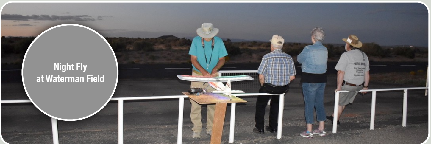
Night Fly at Waterman Field