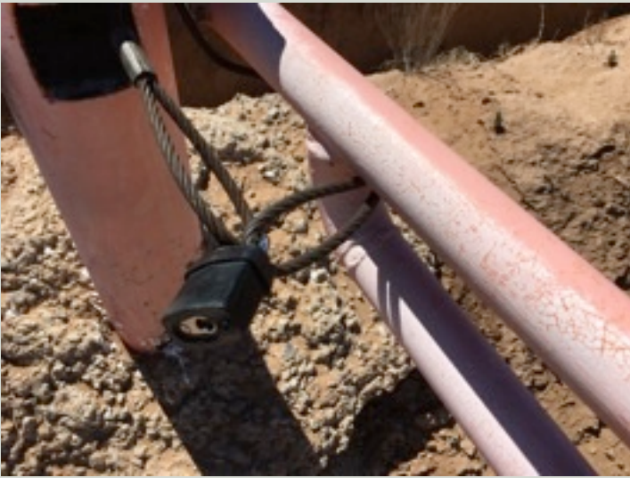
Temporary cable to lock gate