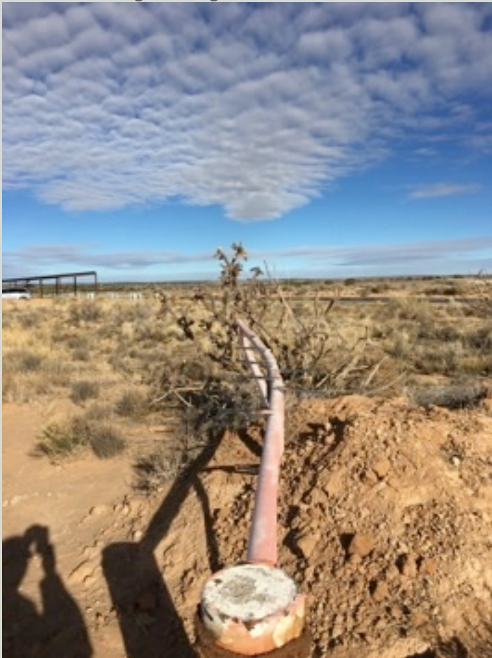
Gate bowed from Vandalism Damage