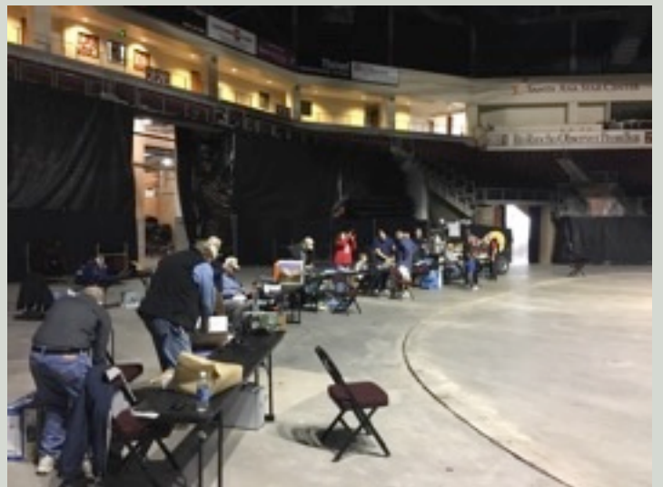
Indoor at the Star Center