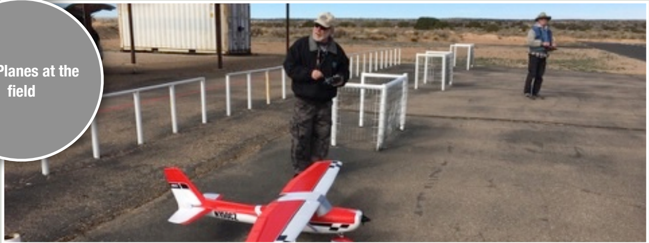
New Planes at the field