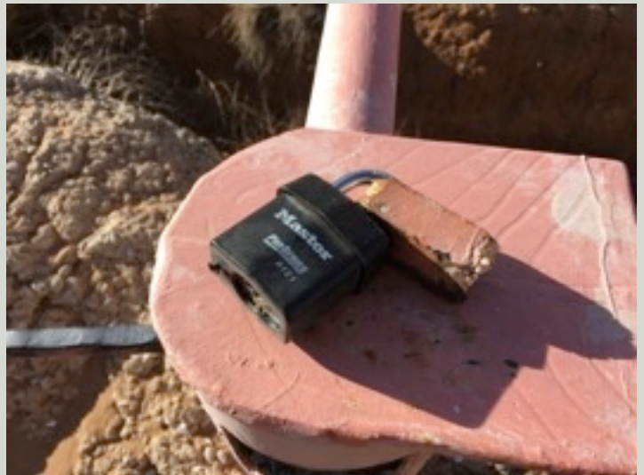
Lock & Lock Bolt broken from