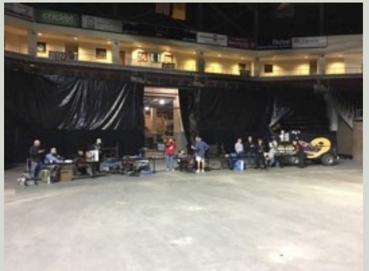
Indoor at the Star Center