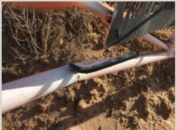
Spikes on gate were damaged