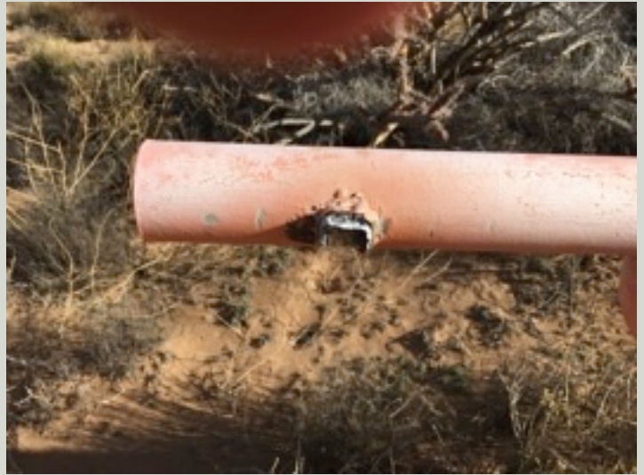
Lock Bolt broken from gate