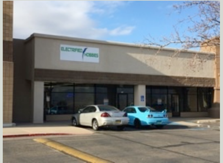
Electrified Hobbies Store Front