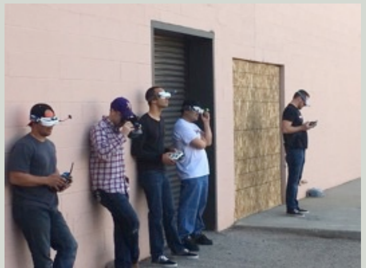
Flying FPV Drones on Opening Day