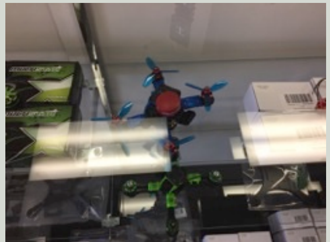
Drones & Parts at Electrified Hobbies