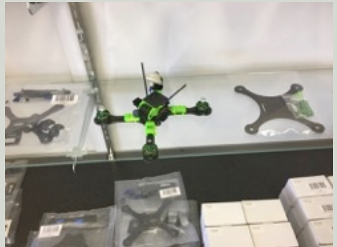
Drones & Parts at Electrified Hobbies