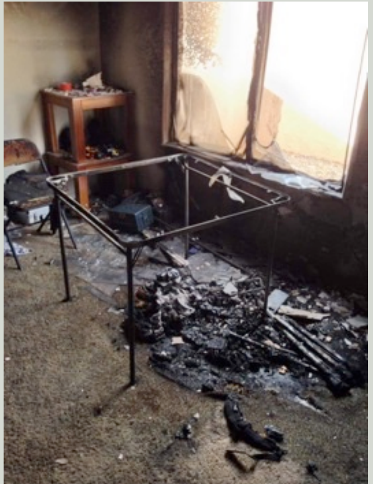
Crispy House Results of a charger fire