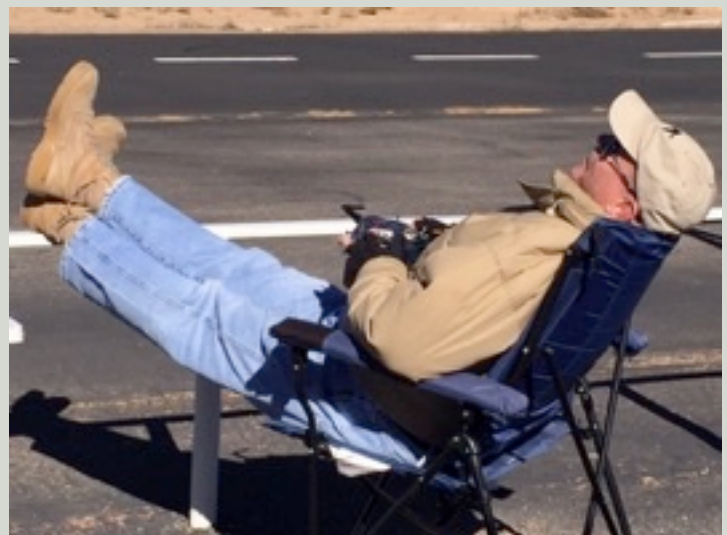
The only way to fly!