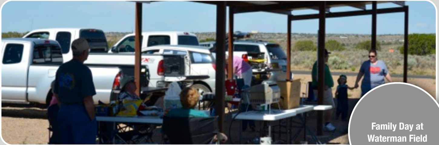
Family Day at Waterman Field